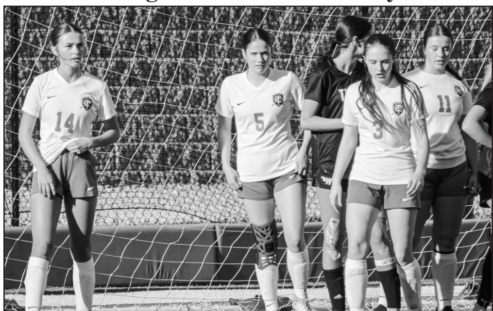
The Lady Indians in action at Lake Oconee Academy.

Both Towns County teams suffered losses their first losses of the year last weekend at Lake Oconee Academy (LOA).